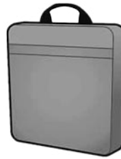
Seat Cushion with Pockets