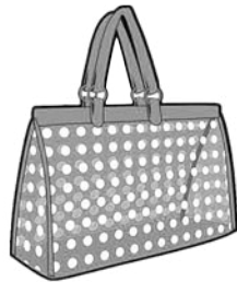
Printed Plastic Handbag