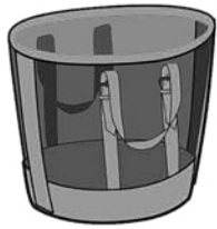
Tinted Plastic Bucket